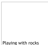
Playing with rocks